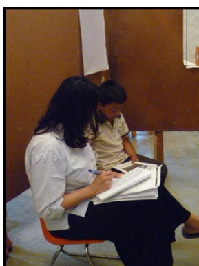
US visiting teacher takes a running record of a 3rd grader.