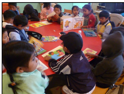
Students selecting books in the school library.