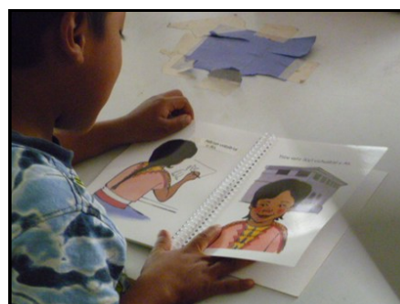
First grader reads a book about his school written in his first language (Ixil).