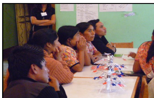
Local teachers attend an afternoon work session.